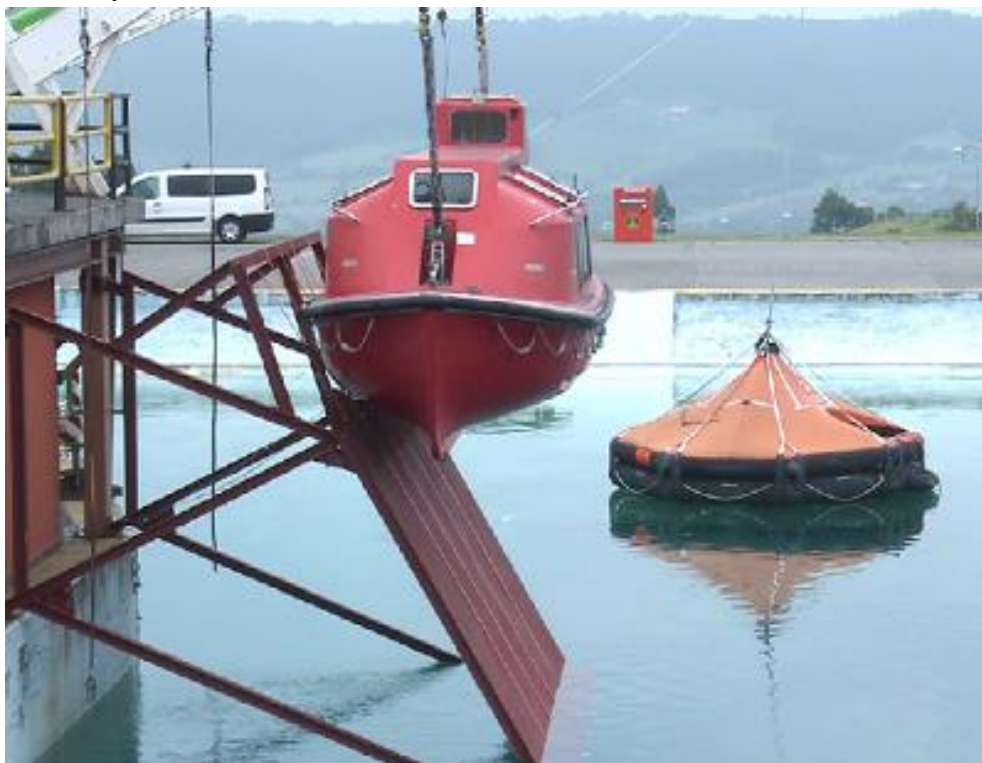
Figure 4. Tests done in basin at Centro Jovellanos in Gijón (SES, launching and recovery system design). Reprinted with permission.

The SES is as previously mentioned one of MONALISA 2.0’s projects and it focuses on what this report is about, the problems that appears with launching lifeboats when a damaged vessel is sinking with a list exceeding 20°. The SES project presents two cost beneficial solutions that can be applied to different types of vessels on their equipped systems with minimal adaptations. Both solutions shall be able to safely launch the lifeboats at heel conditions higher than 20° which is the current SOLAS rule. The solution should mainly be able to work on the ship’s side facing up from the water where there is a higher risk of not launching the lifeboats, referred to as the “upper side” in this report. This is also considered to be the safest side to launch a vessel’s lifeboats (SES, System Validation, ch. 4).