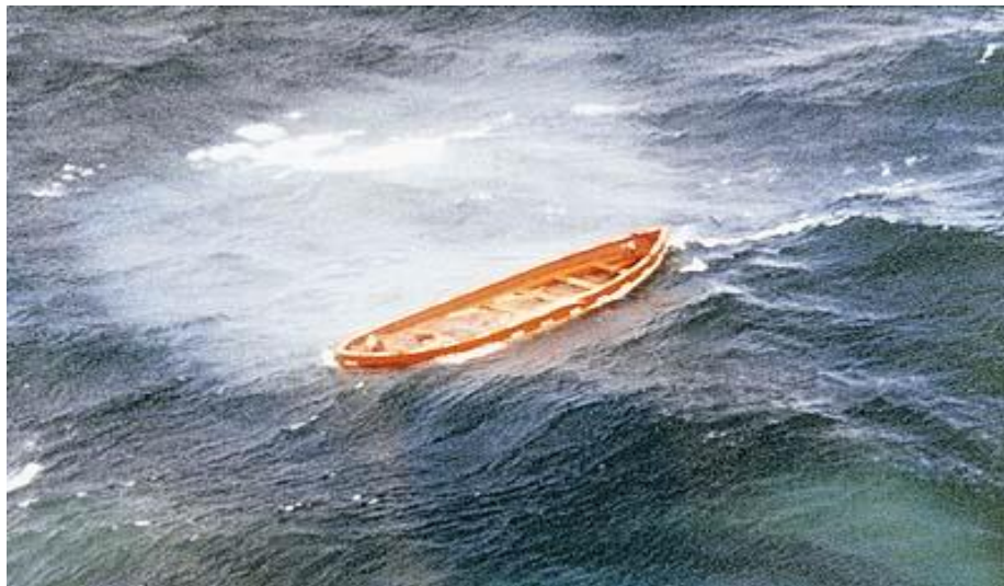
Figure 1. Lifeboat from M/S Estonia.

Onboard the vessel panic spread as passengers tried to make their way towards higher decks and lifeboats, many were trapped in their cabins and were unable to save themselves ( The Joint Accident Investigation Commission , 1997, ch. 1). Estonia was equipped with ten lifeboats but the crew was not able to launch a single one of them, the main reasons are believed to have been the rapidly increasing list and lack of time. Nine lifeboats would break off and float to the surface when she sank ( see picture 1 ) ( The Joint Accident Investigation Commission , 1997, ch. 17.7.1).