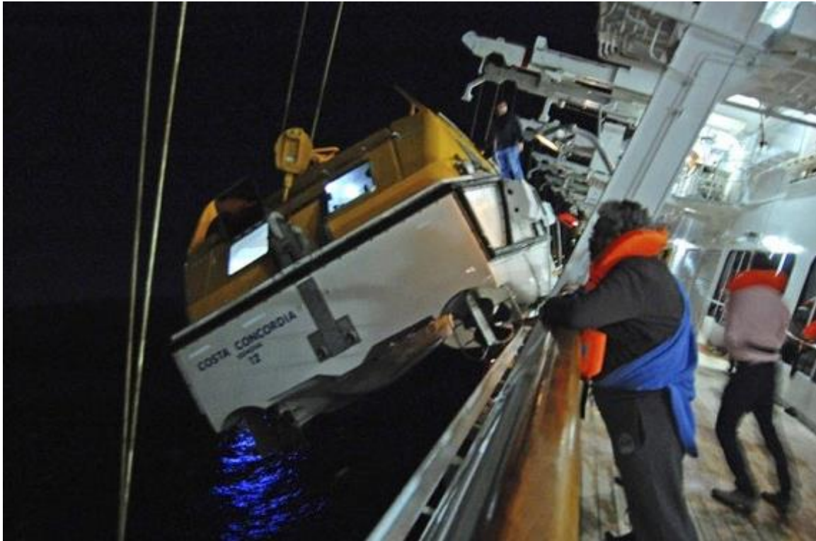
Figure 2. Failure to launch a lifeboat during the sinking of M/S Costa Concordia 2012 (MONALISA 2.0, Activity 3, Launching and Recovering System Design). Reprinted with permission.

As previously mentioned in this report, lifeboats must be able to be launched with a list up to 20°. In this case, the operation to launch the lifeboats began around 11 PM and the list was already close to 20°, only 11 minutes later it would reach 30°. This means that during the operation the list would increase more and be well over the limit. Resulting in 3 lifeboats being unable to be launched and equipment being used way beyond what it had been designed for (Italy's Ministry of Infrastructures and Transports, 2013, p. 88).