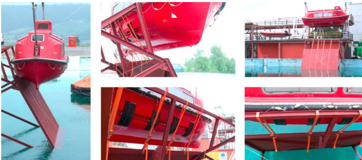
Figure 5. Test with straps and sliding pads done during the MONALISA, SES project (SES, pilot application). Reprinted with permission.

The solution for decreasing friction between the lifeboat and the vessel's hull is sliding pads mounted on the lifeboats hull which will be placed without damaging the hull nor affecting the navigational capability of the lifeboat. The sliding pads are for the lifeboats situated on the “upper part” of the heeled vessel. To ensure a safe passage down the hull without getting stuck, nor the risky operation of heaving it back up.