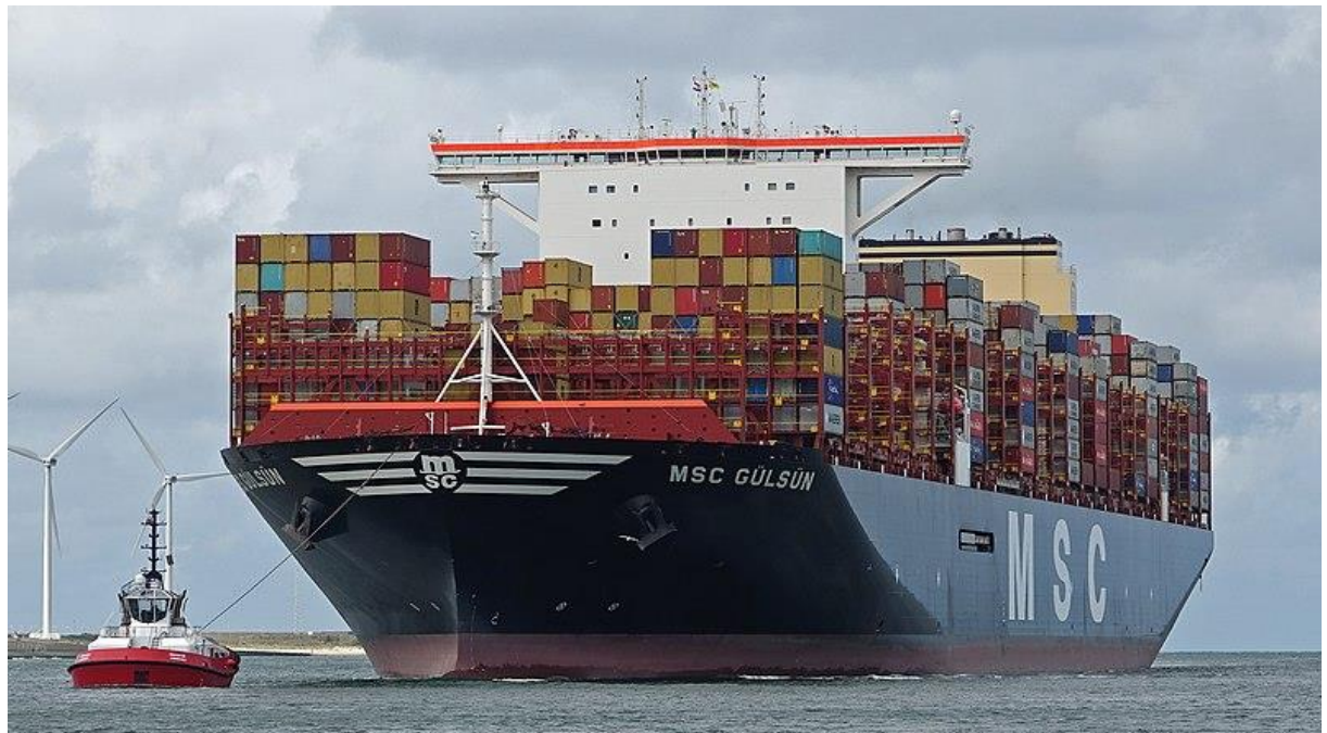
Figure 2 MSC Gulsun

The third largest container vessel in the world is MSC Gulsun (see figure 1) with the length of 400 meters and 62 meters wide and in addition a carrying capacity of 23,756 TEU (MI News Network, 2021). This vessel is the first of its kind that can carry 24 containers side by side across the breadth of its hull and the reported draft on MSC Gulsun is 16 meters (MI News Network, 2021).