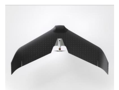
Figure 2.1 Fixed Wing UAV flying

Andrew Chapman, NSW Director of Operations for Australian UAV (2016), says that a fixed-wing type, seen in figure 2.1, are using normal wings as lift force rather than vertical lift rotors As a result of this, the only energy use needed is to move forward, making it a very efficient design with high-speed capacity. Chapman adds that gas engines is an alternative for this type and because of the high energy density in the fuels that (Aviation, 2016). CC-BY