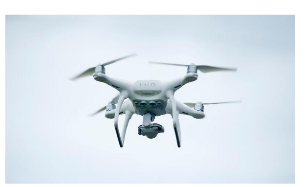
Figure 2.4 Multirotor UAV with camera flying

Multi rotor types of UAVs as shown in figure 2.4 are of a simple construction design and are relatively inexpensive according to Chapman (2016). Chapman also says that the multi rotor is performing well regarding position control and framing and therefore is fit for tasks like photography work aerial and visual inspections. Some drawbacks with the type are (Pidvalnyi, 2018). CC-BY