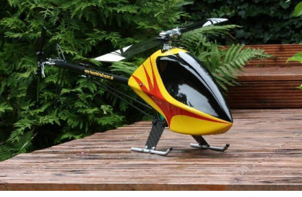
Figure 2.2 Single rotor UAV standing still on the ground (Mckarri, 2009). CC-BY

According to Chapman (2016), a single-rotor type, seen in figure 2.2, is constructed with a blade that spins relatively slow and it is typically much larger than other UAV types. Chapman also says that single-rotors are very efficient and can be powered by a gas engine for longer endurance. Downsides with this type are its complexity, vibrations and more expensive design (Chapman, 2016).