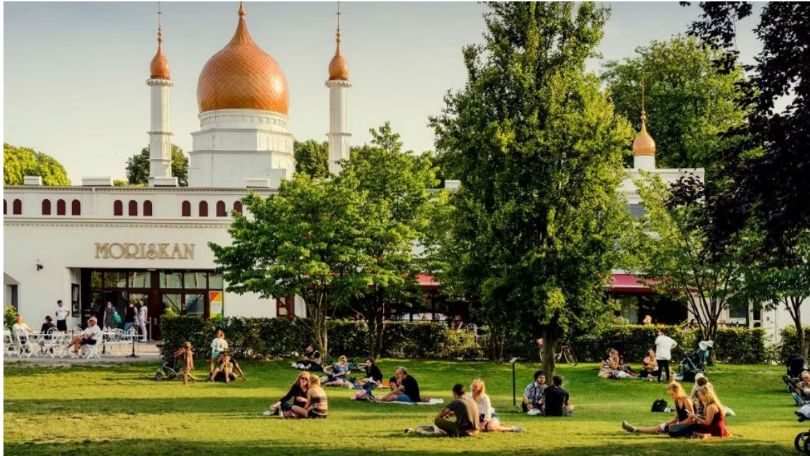
IMG001. The Pavilion.

Moriska Paviljoggen Nordic Architecture 2025