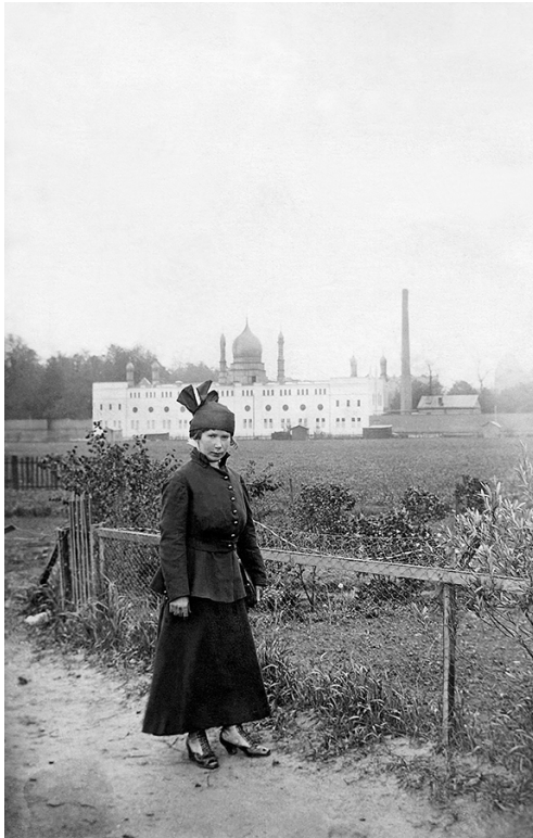
IMG002. The Pavilion in 190 (I)2. Unknown