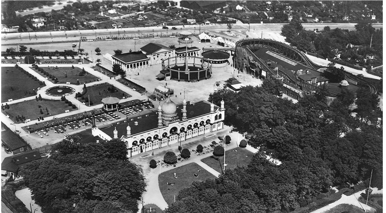
IMG004. The Folkets Park in Malmö.