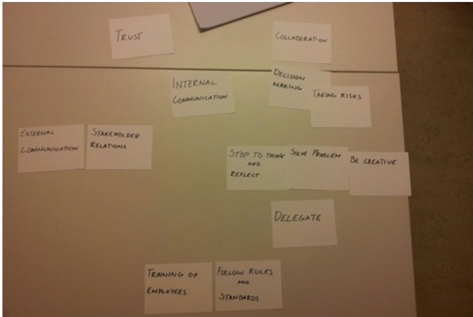
Picture 1, The visualization tool 1, (B) In this picture it is visible that the ranking did not have to be linear but could run parallel in many levels. On the top of the picture Trust and Collaboration are surrounding every other factor.

their way of thinking. In the analysis of the ranking we used a point system. Points were given in four categories, top three, in the middle, lowest three and those taken away. Pictures 1 and 2 show examples of the exercise. FIX THE PICTURE!!!!!!