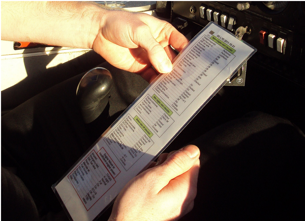
Figure 1 Pilot using a laminated paper checklist in pre-flight check (Hedlund, 2014).