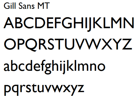
Figure 3 Example of Gill Sans MT font (Hedlund, 2014).

It has also been shown that visual emphasis on the first letter of a word will significantly increase legibility. When writing in lower case it is natural to start a sentence or proper name with an upper-case letter. However, the same effect can be shown when writing in upper-case if the first letter of a sentence is made bigger than the following (Degani, 1992).